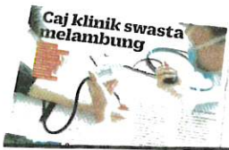
KERATAN Kosmo! semalam.

lagi ketuluan mengenai caj yang dikenakan pihak mereka.