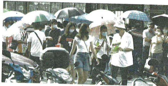
Orang ramai disarankan terus kekal mengamalkan SOP bagi mengelakkan peningkatan kes Covid-19.

Khairy Jamaluddin bagaimanapun berkata, maklumat dari Israel dan Amerika