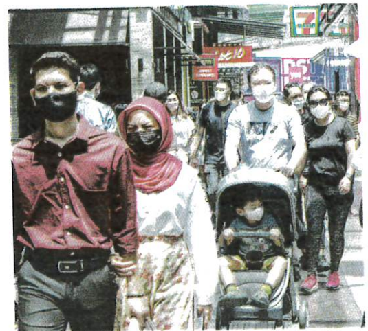
ORANG ramal tetap memakai pelitup muka di tempat terbuka walaupun negara kini beralih ke fasa endemik.

Beliau berkata, pemakaian pelitup muka di premis tertutup masih wajib, namun notis kompaun tidak lagi dikeluarkan sejak 17 April lalu.