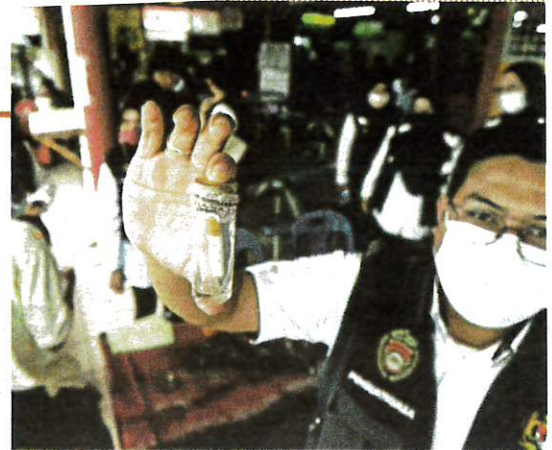
A Health Ministry officer showing a cigarette stub during an anti-smoking operation in Penang.

He said the ministry had held discussions with several min-