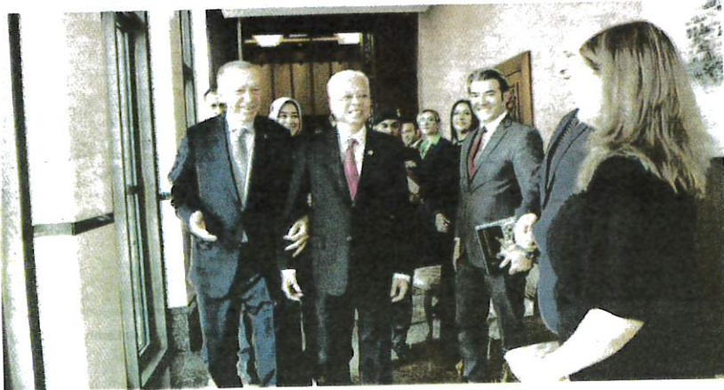
ERDOGAN (kiri) bersama Ismail Sabri selepas mengadakan pertemuan di Turkiye.

AKHBAR : KOSMO MUKA SURAT : 4 RUANGAN : NEGARA