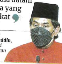
Khairy Jamaluddin, Menteri Kesihatan

Jika seseorang itu sudah dijangkiti Omicron, dia boleh dijangkiti semula dengan BA.5. Sebab itu, kita dengar banyak kes orang yang dijangkiti semula dalam masa yang singkat