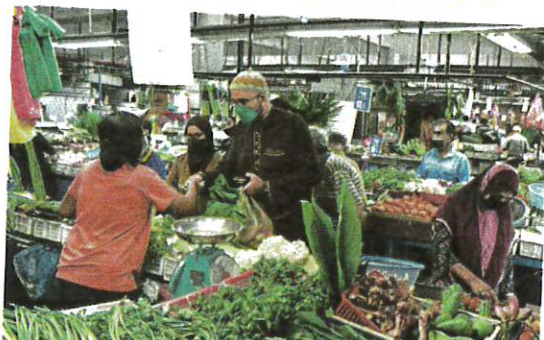
People wearing face masks as they shop for necessities ahead of Hari Raya Aidiladha at Pasar Batu Lanchang in George Town yesterday.

He said up to Thursday, a total of 41,297 people who underwent tests had reported their results, and of the number, 4,874 were RT-PCR tests, 25,217 were RTK-Anti-