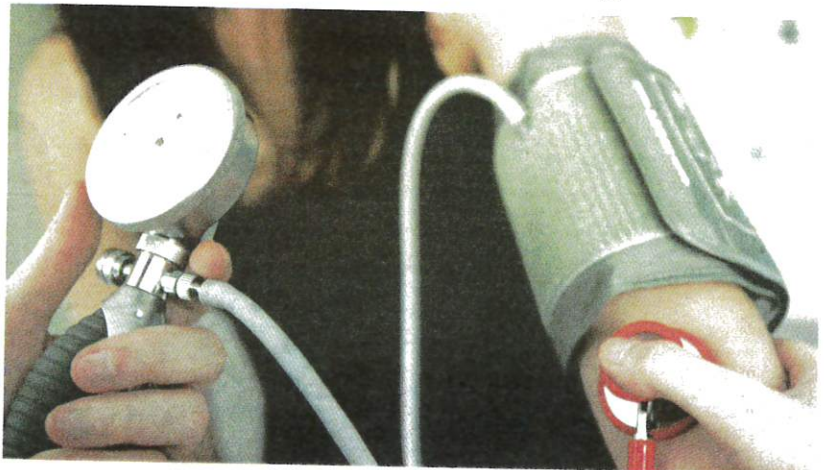
KLINIK swasta ada memohon dengan dengan KKM menaikkan caj rawatan di fasiliti kesihatan.

Beliau berkata demikian ketika ditanya mengenai laporan muka hadapan Kosmo! semalam