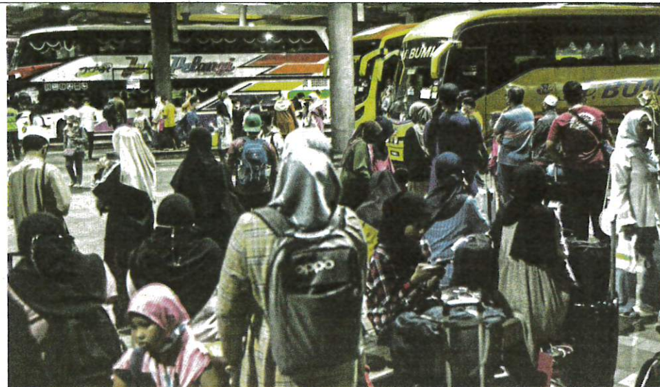
Passengers preparing to board buses at the Kuala Terengganu City Council bus station on Thursday. Health Minister Khairy Jamaluddin reminded the people to stay vigilant during Hari Raya Aidiladha celebrations to prevent the spread of Covid-19.

Perak reported 295 cases, followed by Sabah at 205; Negri Sembilan (197), Penang (128), Melaka (107), Putrajaya (90), Jo-